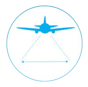
+ 20,000 pixels across