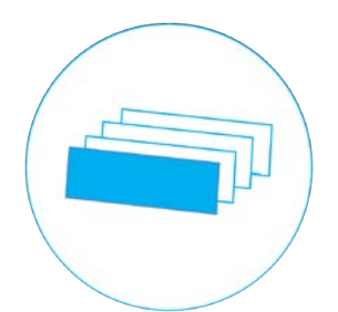
2 frames per second